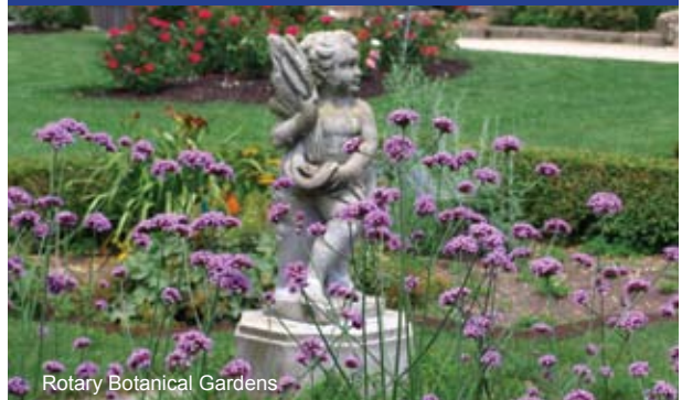
Rotary Botanical Gardens