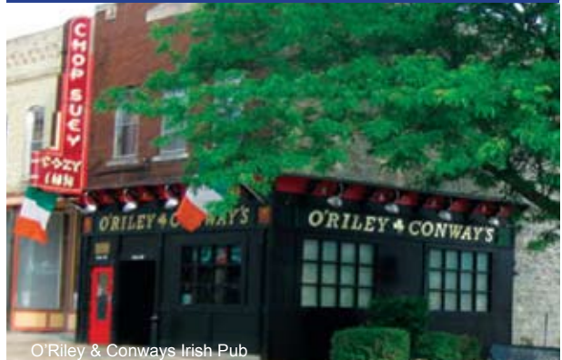
O'Riley & Conway's Irish Pub