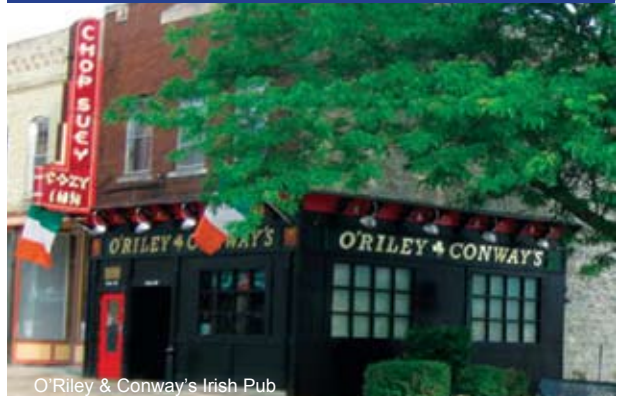
O'Riley & Conway's Irish Pub