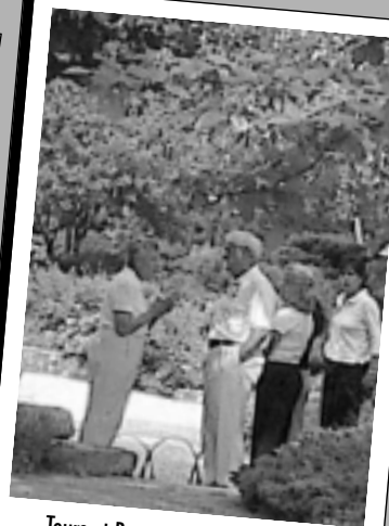
Tours at Rotary Botanical Gardens