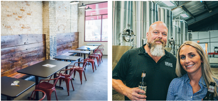
Rock County Brewing & Gray Brewing

Enjoy a tour through 20-acres of scenic walkways that wind their way through picturesque bridges, an ornate gazebo, and heavenly-scented flower gardens.