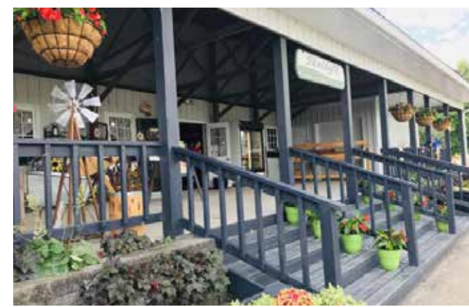
Skelly's Farm Market

Three seasons of goodness run from strawberries to sweet corn to pumpkins. Activities are available, including a free playground for the kids and a fall corn maze. The farm also has a retail store, gift shop and bakery.