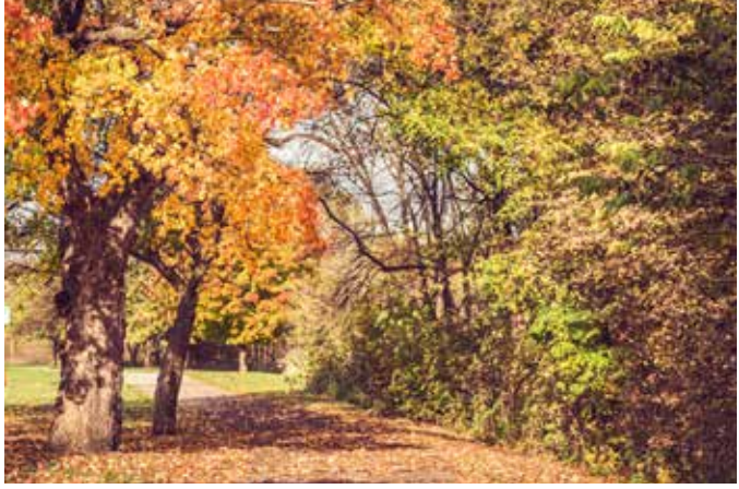
Palmer Park

Janesville's 30 miles of trails, including a segment of the statewide Ice Age National Scenic Trail , connect many neighborhoods, parks and attractions. In the winter, the trails, parks and greenbelt system are available to cross country skiers and snowshoers. Pets are welcome on the trails from September 16 through May 14. Most of the trail in Janesville is paved, perfect for biking, walking, running and rollerblading.