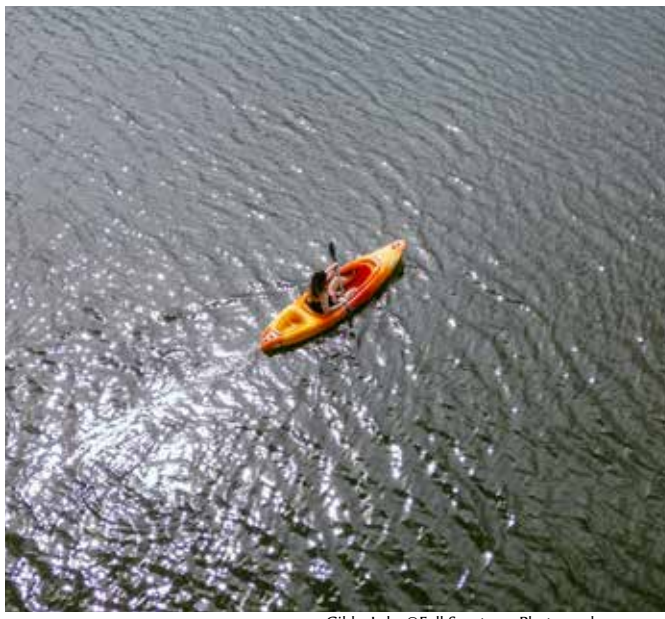
Gibbs Lake

Velocity Downtown Adventures & Rentals has e-bikes, fat tire, and e-scooters, as well as kayak and stand up paddleboards. They also offer guided bike tours. Drift Away Paddle Co and Paddle Time offer kayak rental as well as guided trips.