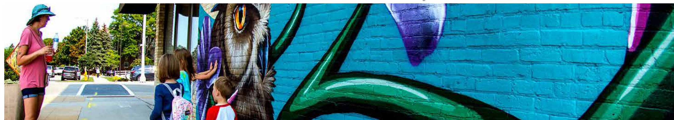
River of Life Mural ©Pat Sparling Photography