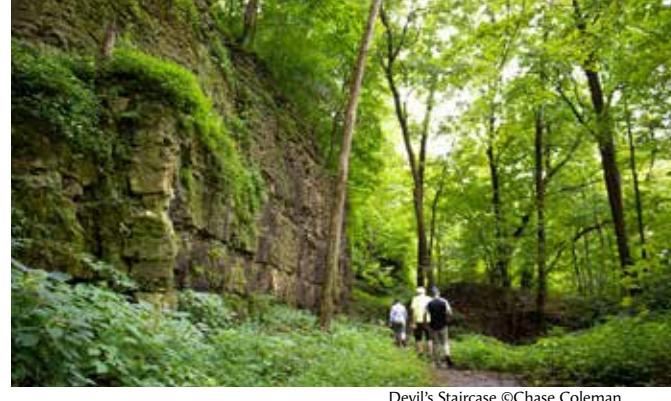
Devil's Staircase

A few portions of the trail, notably the Devil's Staircase in Riverside Park and a segment that runs through the Robert O Cook Memorial Arboretum, are unpaved and suitable for hiking.