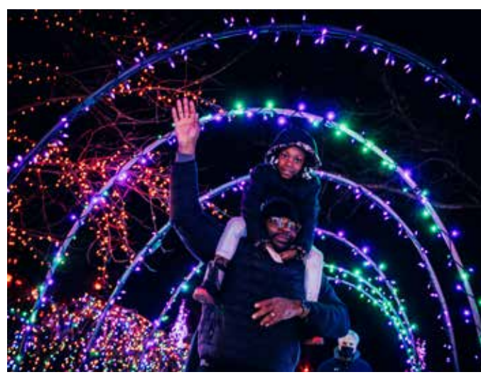
Rotary Botanical Gardens Holiday Light Show

This award winning, 20-acre non-profit botanic garden is home to many dramatic and themed gardens. Some have an international focus, such as the Japanese and English Cottage gardens, while others are less formally-structured, such as the children's garden, Wellness Garden, Hosta Hollow, the fern and moss garden, and other seasonal displays. Much of the garden is wheelchair and stroller accessible, with wide, level paths and many benches to sit and take in the surrounding beauty. In December, the Gardens presents the spectacular Holiday Light Show.