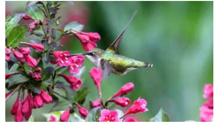
Rotary Botanical Gardens

With our variety of habitats many species of birds can be found throughout the year. Janesville achieved Bird City designation in 2013 from Bird City Wisconsin. Excellent locations for birding in Janesville include the Robert O. Cook Memorial Arboretum, Riverside Park, Rockport Park, Rotary Botanical Gardens, Monterey Park and Sheffer Park.