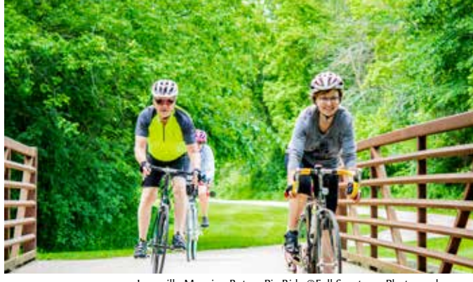
Janesville Morning Rotary Pic Ride

Take a leisurely family bike ride on the 30 miles of paved trails that connect several parks and the downtown, or explore miles of mountain biking trails winding through Rockport Park. Go the distance on country roads or follow the trail connecting neighboring communities. Check out downtown Janesville for options closer to the heart of Janesville. The City of Janesville has been granted a bronze-level Bicycle Friendly Community (BFC) award by the League of American Bicyclists.