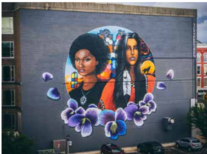
Mural by Jeff Henriquez.

Discover the vibrant beauty found year-round along Janesville's outdoor public art trail. It includes, 25+ large scale murals created by local, national and international artists.