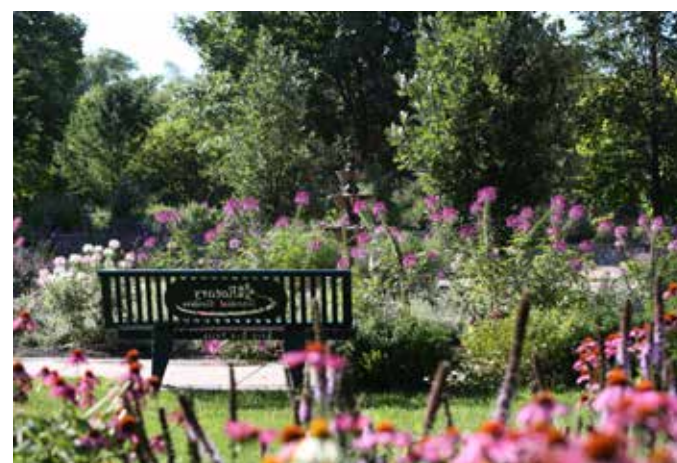
Rotary Botanical Gardens