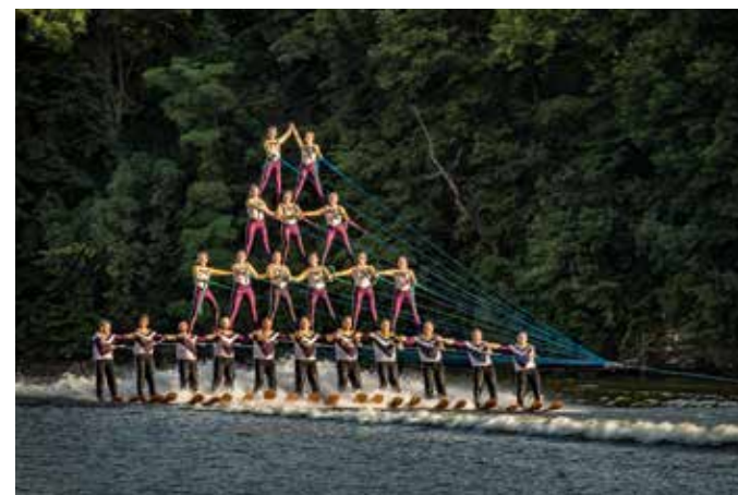
Rock Aqua Jays

Experience the most successful water ski show team in the world with more than 60 total tournament victories, including 21 U.S. National Championships. The team performs free water ski shows on Sunday and Wednesday evenings from Memorial Day weekend through Labor Day at Janesville's Traxler Park.