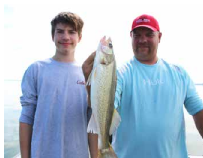
Pike Pole Guided Fishing