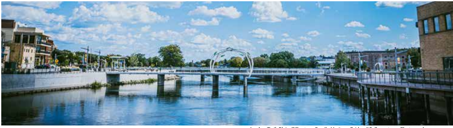
Ice Age Trail, Blain Gilbertson Family Heritage Bridge